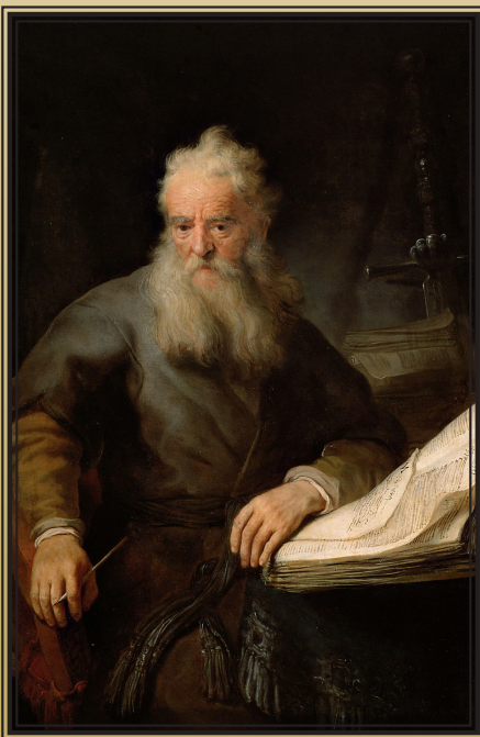
Rembrandt Harmensz. van Rin 163

Wednesday January 17th • 2-3.30pm (UK time)